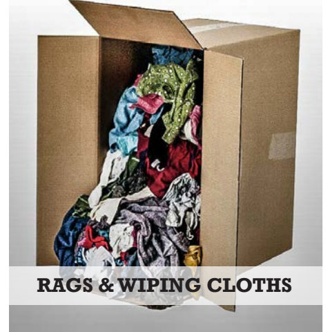
RAGS & WIPING CLOTHS