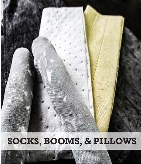
SOCKS, BOOMS, & PILLOWS